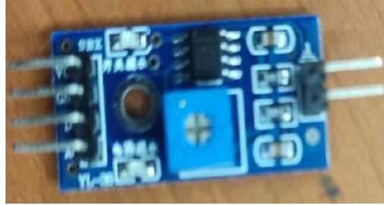
Fig.5. Moisture sensor

Measuring soil moisture is important in agriculture to help farmers manage their irrigation systems more efficiently. Not only are farmers able to generally use less water to grow a crop, they are able to increase yields and the quality of the crop by better management of soil moisture during critical plant growth stages. Besides agriculture, there are many other disciplines using soil moisture sensors. Golf courses are now using sensors to increase the efficiencies of their irrigation systems to prevent over watering and leaching of fertilizers and other chemicals offsite.