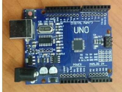
Fig.7 Arudino IDE

programming approach is to use the Arduino IDE, which utilizes the embedded C programming language. This gives you access to an enormous Arduino Library that is constantly growing thanks to open -source community.