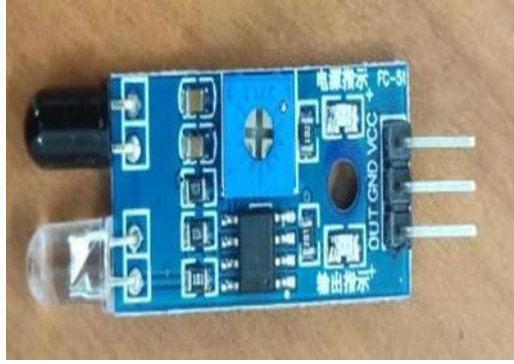
Fig.3 IR Sensor

The thermal effects of the incident IR radiation can be followed through many temperature dependent phenomena. Thermocouples and thermopiles use the thermoelectric effect.