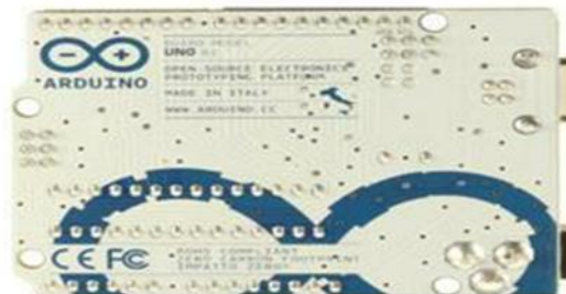
Fig.2 Arduino Uno R 3 back panel

The Arduino Uno is a microcontroller board based on the ATmega328 (datasheet). It has 14 digital input/output pins (of which 6 can be used as PWM outputs), 6 analog inputs, a 16 MHz ceramic resonator, a USB connection, a power jack, an ICSP header, and a reset button. It contains everything needed to Support the microcontroller; simply connect it to a computer with a USB cable or power it with a AC -to -DC adapter or battery to get started. The Uno differs from all preceding boards in that it does not use the FTDI USB - to - serial driver chip. Instead, it features the Atmega16U2 (Atmega8U2 up to version R2) programmed as a USB -to - serial converter.