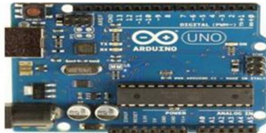
Fig.1 Arduino Uno R3 front panel