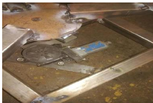
Fig.6 Gear motor

A small motor (ac induction, permanent magnet dc, or brushless dc) designed specifically with an integral (not separable) gear reducer (gear head).