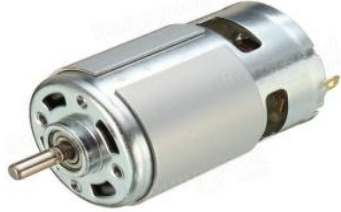
Fig:4 DC motor

attached to all the four wheels and two motor drivers will be connected to each side.