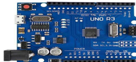
Fig:3 Arduino Uno R3

The Arduino Uno R3 acts as an intermediate agent between the voice recognition module and the motors to drive the wheelchair. It is a microcontroller board based on the ATmega328P. It has 14 digital input/output pins, 6 analog inputs, a 16 MHz quartz crystal, a USB connection, a power jack, an ICSP header and a reset button. It contains everything needed to support the microcontroller. It receives the input given to the voice recognition module and converts into the format accepted by the motors and thus the motors works according to the command given. The Arduino needs to be interfaced to the motors as well as the voice control module.