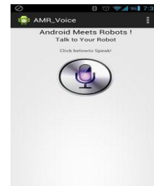
Fig:6 Android App