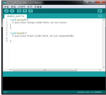
Fig:7 Arduino IDE

Programs written using Arduino Software (IDE) are called sketches. These sketches are written in the text editor and are saved with the file extension .ino. The editor has features for cutting/pasting and for searching/replacing text. The message area gives feedback while saving and exporting and also displays errors. The console displays text output by the Arduino Software (IDE), including complete error messages and other information. The bottom righthand corner of the window displays the configured board and serial port. The toolbar buttons allow you to verify and upload programs, create, open, and save sketches, and open the serial monitor.