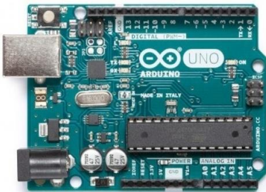
FIG.3.2 MICROCONTROLLER ATMEGA328.

The Arduino-Uno is a micro controller board based on the ATmega328. Arduino is an open-source, prototyping platform and its simplicity makes it ideal for hobbyists to use as well as professionals.