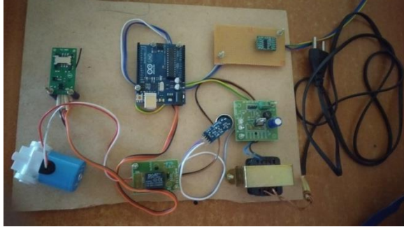
FIG 4.2. FINAL DESIGN OF THE PROJECT