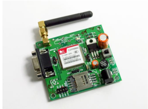
Fig 3.3 GSM SIM900A Module

GSM/GPRS TTL modems SIM900 quad-band GSM/GPRS device, works on frequency 850 MHZ,900HZ,800MHZ & 1900HZ. It is very compact in size & easy to use as plug in GSM Modem. The modem is designed with 3V3 and 5V DC TTL interfacing circuitry, which allows user to directly interface with 5V microcontrollers as well as 3V3 microcontrollers.