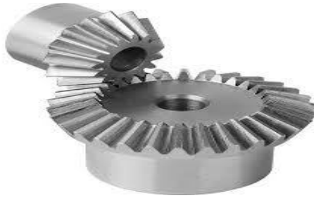
Fig. 3 Bevel Gear