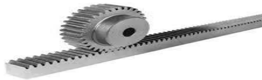
Fig. 2 Rack and Pinion

A rack and pinion is a pair of gears which convert rotational motion into linear motion. The circular pinion engages teeth on a flat bar the rack. Rotational motion applied to the pinion will cause the rack to move to the side, up to the limit of its travel. The pinion is in mesh with a rack. The circular motion of the pinion is transferred into the linear rack movement [5].