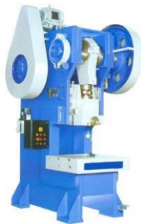
Fig.2 Power press machine.

It is the metal forming machine. This used to tool designed to cut or sheet metal forming. Press machine tool easy to mass production work. The