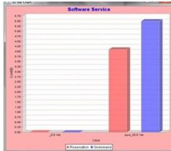
Fig 2: Consumer resource utilization of Software service details in rtuop (with false Prediction) algm

arrangement can happen. This provisioning issue rate is low distinction with OCRP calculation.