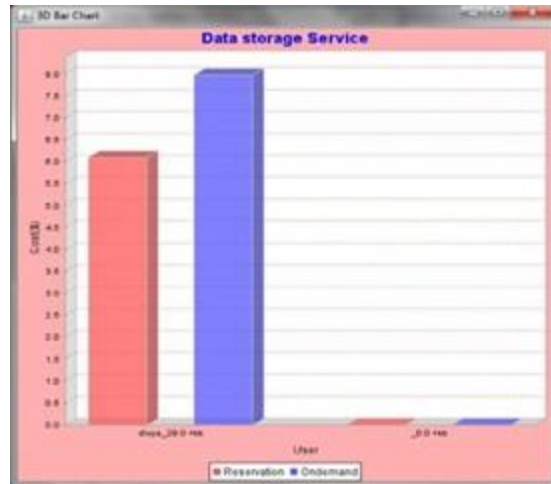
Fig 1: Consumer resource utilization of Data storage service details in rtuop (with true prediction) algm

Fig 1 demonstrates the excellence between the on-request arranges and reservation arrange value of knowledge reposition administration technique. Since there square measure used to situation Reduction system distributed by least expense and least handling time in reservation technique. They'll be simply selected within the shopper and value of sections is used within the graph.