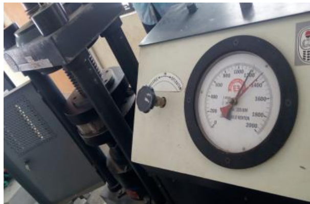
Fig 4.1 Compressive strength test

IS: 15658:2006. The paver blocks were casted control mix .The paver blocks were cured for 7 and 28 days. For determining compressive strength, paver blocks were tested in compressive testing machine. The result was obtained as follows.