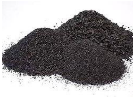
Fig 2.1 Steel slags