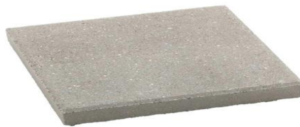
Fig 2.2 Paver block

this we used rubber mould. The rubber mould is of size 19 x 24 x 5 (cm).