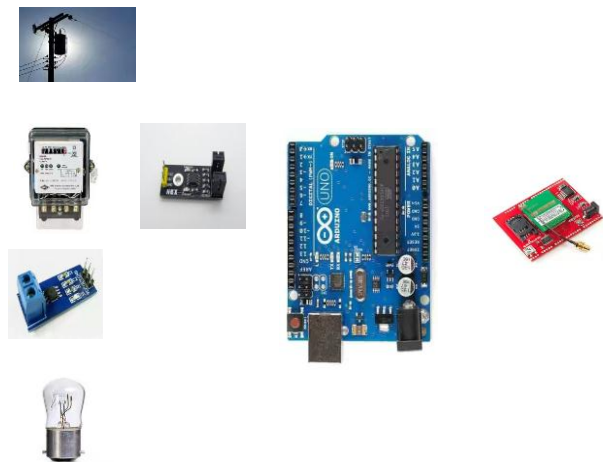
Figure 1.1 Block Diagram

The schematic diagram that shows below is Smarting Watt-Hour Cite For Indication Cum Tension Stealing Revelation System. This diagram explicates the power theft indication and bill method. The supply from the distributed pole is injected to the energy meter and output is connected to load through current sensor. In the most of the energy meter, LED is connected to show the number of units consumed by consumer in the form of blinking. Based upon the blinking, it is easy to calculate the power consumption. So the opto coupler is connected with Watt-Hour meter to sense the output of current sensor. The output of opto-coupler and current sensor are given to arduino for comparing. After the comparing output of both sensor, the arduino will generate an error signal. Based upon the signal, it will send the message to consumer and nearby substation through GSM module.