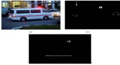
Fig. 4: (a) Image of a vehicle during daytime (b) Detection of all lights (c) Emergency vehicle detected

blinking. This is achieved by taking account for the fact that the red light shall appear in every third frame only. The other lights do not appear in the image sequence with this frequency and hence are eliminated. This leads to the conclusion of the presence of an emergency vehicle as shown in Fig. 4(c).