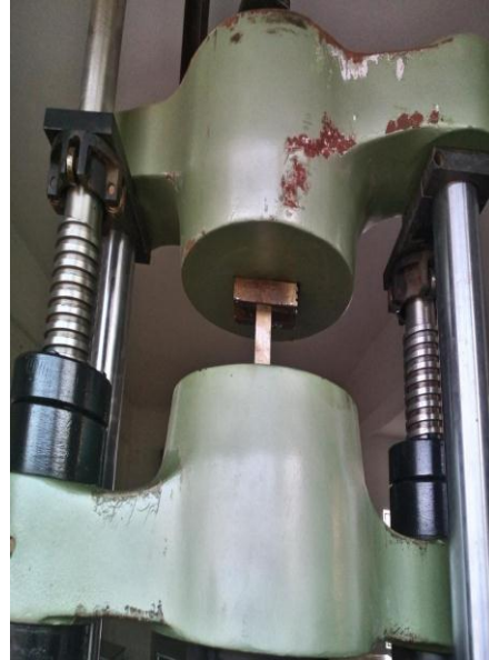
Fig. 1: During the Compression Test

Universal compressive testing machines (UTM), Vickers calipers, stop watch, dial gauge. Are used. The structure components such as columns and struts are subjected to compressive load in applications. These components are made of high compressive strength materials. Not all the materials are strong in compression. Several materials, which are good in tension, are poor in compression. Many materials poor in tension are good in compression. Cast iron is one such example. This strength is determined by conducting a compression test. During the test, for ASTM standard the specimen is compressed and deformation Vs. stress the applied is recorded. Compression test is just opposite in nature to tensile test. Nature of deformation and fracture is quite different from that in tensile test. Compressive load tends to squeeze the specimen. Brittle materials are generally weak in tension but strong in compression.