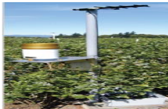
Figure 1: Smart farm system.

The Smart Farm Field Monitor measures moisture level, temperature and data received from irrigation systems. All Smart Farm System components transfer data through wireless to the hub. The data is transmitted to a computer, enabling you to view data and monitor farm variables. All data is saved in CSV files. Additionally the system can control irrigation systems and pond levels. It also allows for future enhancements to be made.