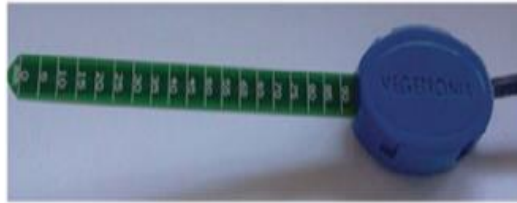
Figure 2: Soil moisture Sensor.

Sensor technology has become commonplace in a wide variety of industry sectors, particularly