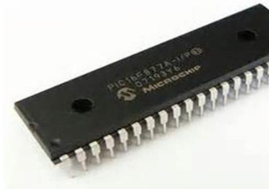
Fig 2. Pin diagram of PIC16F877A