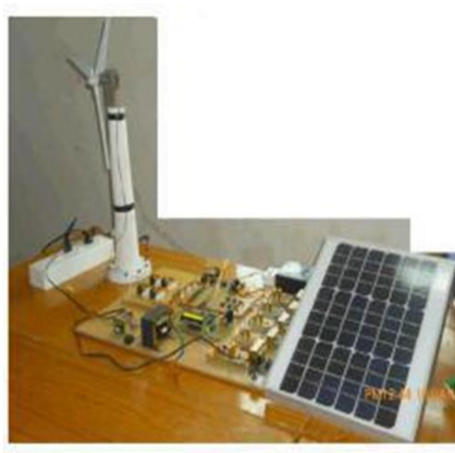
Fig.1 Experimental Setup